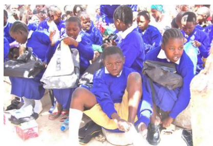
New Shoes at Mbalawala