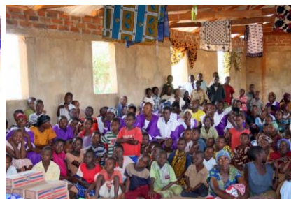
Awaiting uniform distribution at Loje

CONTACT: LAUREN SALMINEN Program Coordinator