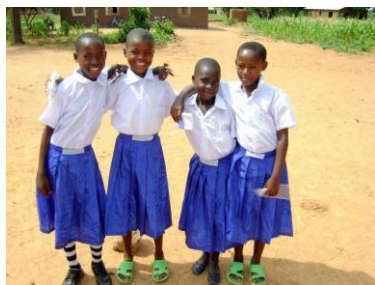
Girls at Iringa Mvumi

Go go: http://www.episcopalchurch.org/130117_ENG_HTML.htm