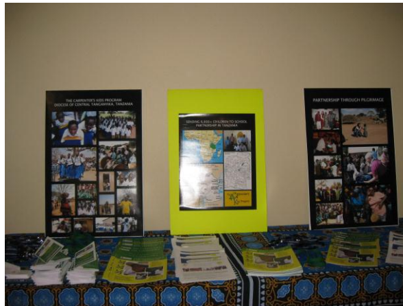
CK Conference Display

The conference, attended by 300 people from 63 Dioceses and 12 Countries across the Anglican Communion, definitely represented a cross section of 'everyone everywhere'.