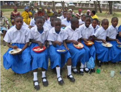
Carpenter's Kids at The Cathedral of the Holy Spirit in Dodoma