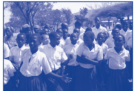
See Visit to Tanzania, page 5.

Your service today as ECW officers and members in this diocese is reflected in the reports and articles in this Newsletter. On your behalf I am most appreciative of the continuous support of ECW’s ministry and mission received from our bishops and priests, as well as, diocesan and parish staffs.