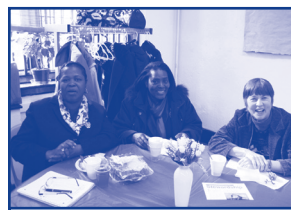
Fall UTO Ingathering luncheon.

I once again had the privilege to present our gifts on behalf of our diocese at the Eucharist Service of the United Thank Offering at the 76 th General Convention held in Anaheim, California.